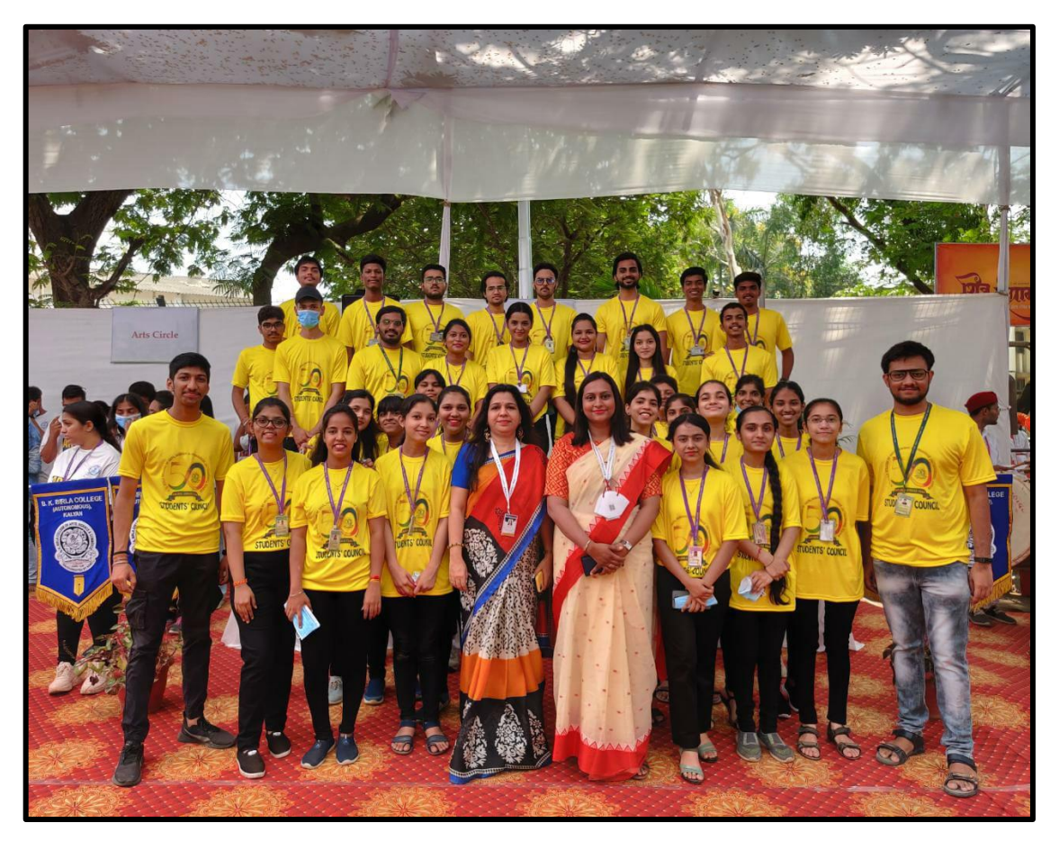
Students' Council troupe during Convocation Ceremony